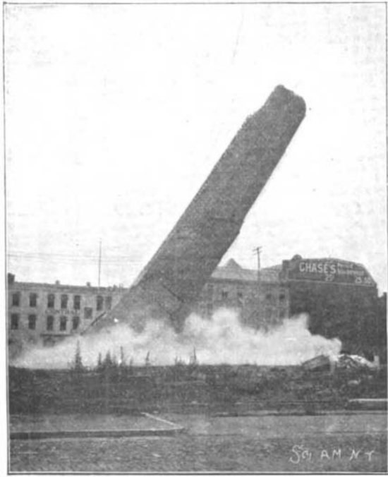
RAZING A BIG STACK WITH DYNAMITE AT WASHINGTON, D. C.

About eight years ago the Capital Traction Company