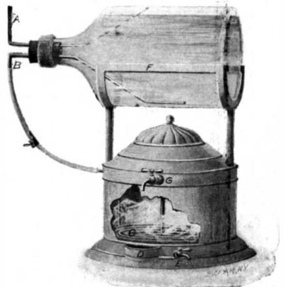
A NEW FORM OF WATER COOLER.

This form of water cooler embodies many excellent advantages. Primarily, of course, the water is cooled without being contaminated by contact with the ice. Again, only a small amount of water is cooled at a time, so that when a fresh bottle has been connected up, one does not need to wait until its entire contents have been cooled before obtaining a glassful of cold water. Mr. Conover's cooler will further be found very economical in its consumption of ice. Aside from these, other advantages which our limited space prevents us from enumerating, will readily suggest themselves to our readers.