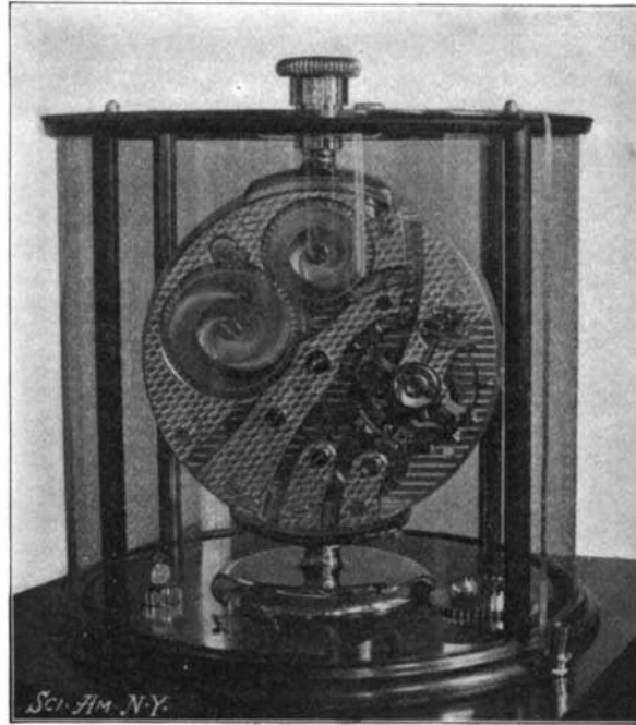
THE LARGEST WATCH EVER MADE.

What is probably the largest watch ever constructed was recently completed by the Waltham Manufactur-