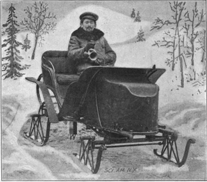
AN AUTOMOBILE SLED.

The Nuernberger Motorfahrzeuge-Fabrik "Union" is about to manufacture an automobile sled, of which we reproduce herewith a photographic illustration. By reason of the fact that the mechanism has not