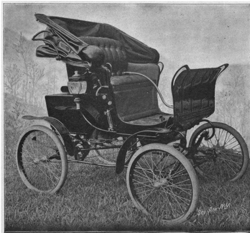
THE GROUT STEAM STANHOPE.

The German Emperor has offered a prize for a motor car suited for the purposes of the farmer. The award will be made some time next year by the Emperor himself.