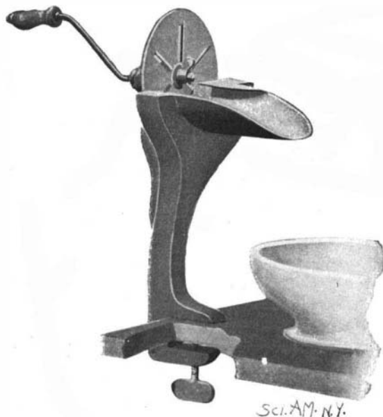
A VEGETABLE-CUTTING MACHINE.

The vegetable-cutter comprises an upright carrying at its top a tray open at the front and rear. The upright is attached to a table by means of a clamping