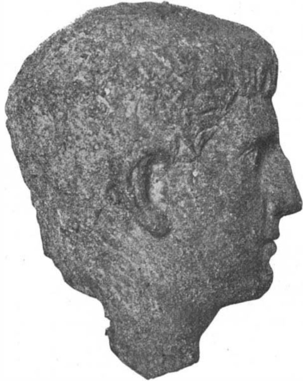
BRONZE HEAD OF THE ROMAN EMPEROR TIBERIUS EXCAVATED NEAR TURIN.

During the work of excavating for the foundations of the new building of the Opera Pia di San Paolo, the pawnbroking and loan establishment in the Via Monte