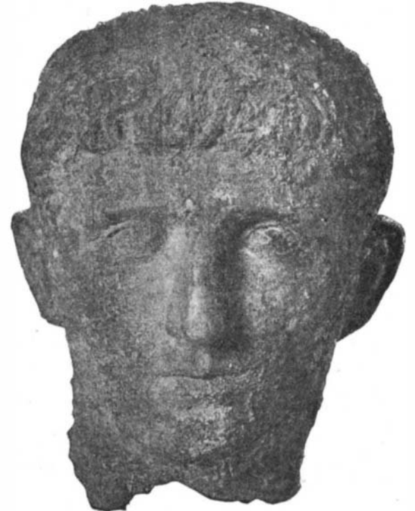
BRONZE HEAD OF THE ROMAN EMPEROR TIBERIUS EXCAVATED NEAR TURIN (FRONT VIEW).

many colors, with feathers and with wampum, and sometimes to paint stripes upon the body also. It was then hung from a pole near the Long House until the hour arrived for taking it within that structure for the sacrifice. In the time of the historian Lewis H. Morgan, the body of the dog was borne to the blazing altar upon a sort of bark litter behind which the people came in Indian file. Speeches and chants were made over the dog, the people joining in the ceremony. Tobacco was burned, as it still is at the New Year's festival; this, as already noted, being the Indian method of burning incense as an offering to the Great Spirit. It is supposed to be an offering especi-