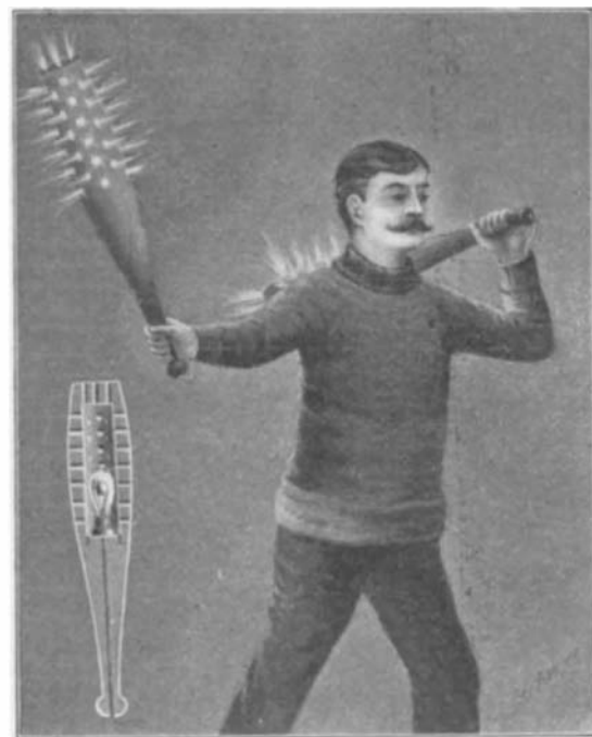
ILLUMINATED INDIAN CLUB.