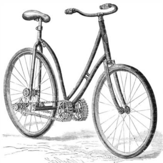
WEEKS' WALKING BICYCLE.

The inventor states that this particular form may be modified by reducing the size of the rear wheel