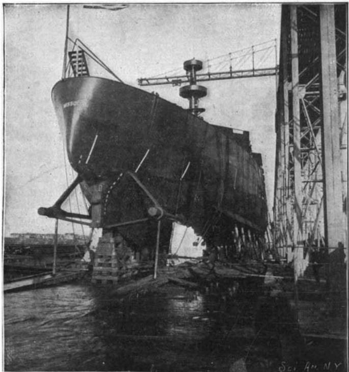
STERN VIEW OF THE BATTLESHIP "MISSOURI."