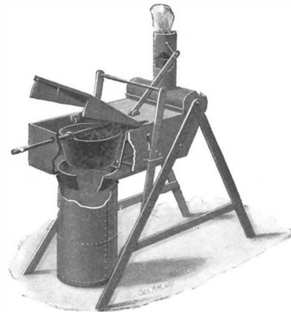
A DUSTLESS ASH-SIFTER.