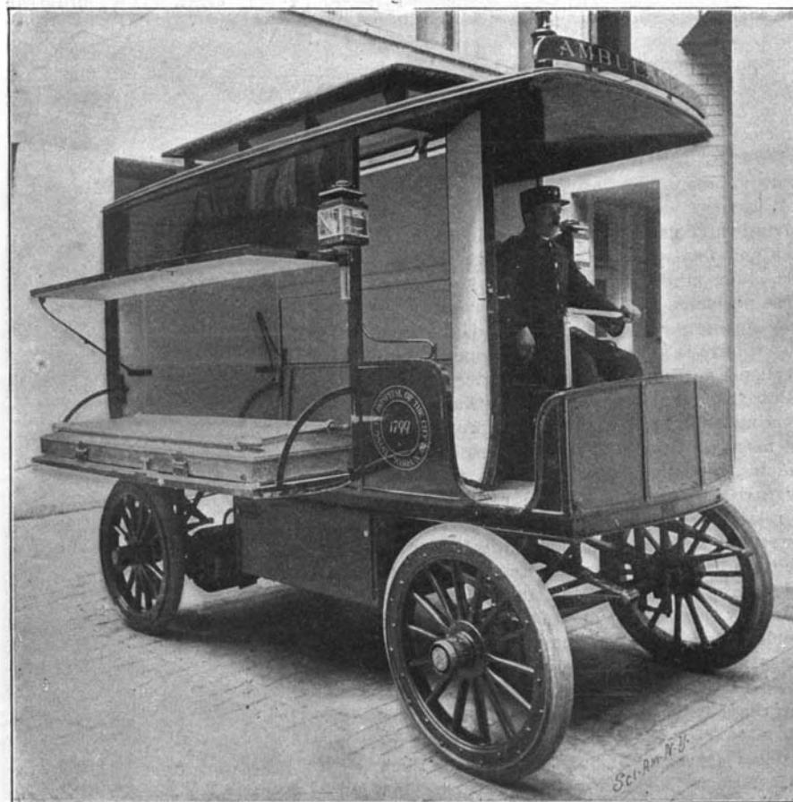
THE ELECTRIC AMBULANCE OF THE LYING-IN HOSPITAL.

Under date Feb. 26, 1902, the State Department has received from the French embassy, Washington, notice of an international competition of motors and apparatus using alcohol for generating motive power, light and heat, to be held in Paris in May, 1902. This competition will include practical tests, after which medals and objects of art will be awarded, and it will be followed by a public exposition from May 24 to June 1, 1902. The competition includes: (1) Automobile boats. (2) Lighting and heating apparatus. (3) Stationary and portable motors and motor groups. Requests of exhibitors not taking part in the competition will be received until April 15, 1902. The exhibit will include, besides motors and apparatus using alcohol, apparatus producing industrial alcohol, receptacles for storing and transporting this product, apparatus worked by exposed motors, and compounds of alcohol. Sites for exhibition are free.