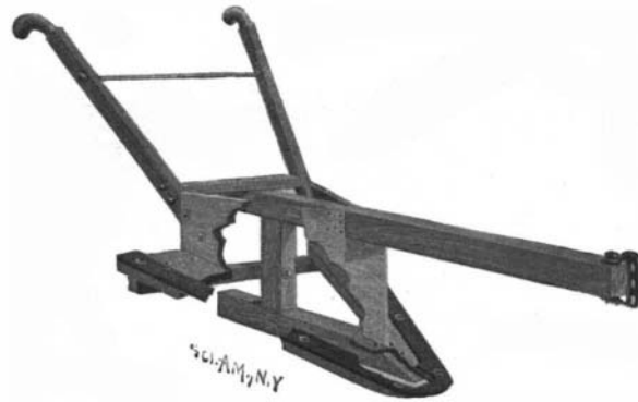
DOUBLE-MOLDBOARD HILLING-UP PLOW.

The moldboard may be termed a "double moldboard," for it consists of a V-shaped central portion formed