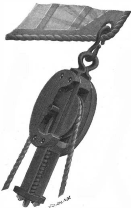
A NEW SPRING BLOCK.

Our illustration shows a new spring block recently invented by P. J. Macdonald, of New London, Conn., which should prove of great value to yachtsmen. It differs from the ordinary block in having straps on each side of the sheave slidably fitted into the shell and held under the tension of a spiral spring coiled around a central guide-rod. The straps are joined at one end to form a becket, and at the other end are secured to a cross-piece against which the coil-spring bears. The play of the block is limited by the longi-