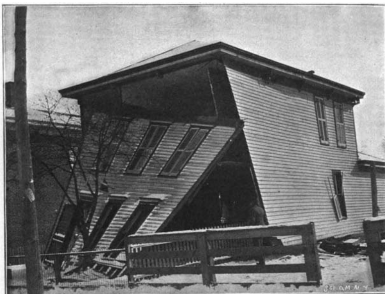
A HOUSE AT FORT WAYNE, IND., PARTIALLY DESTROYED BY AN ACETYLENE GAS EXPLOSION.