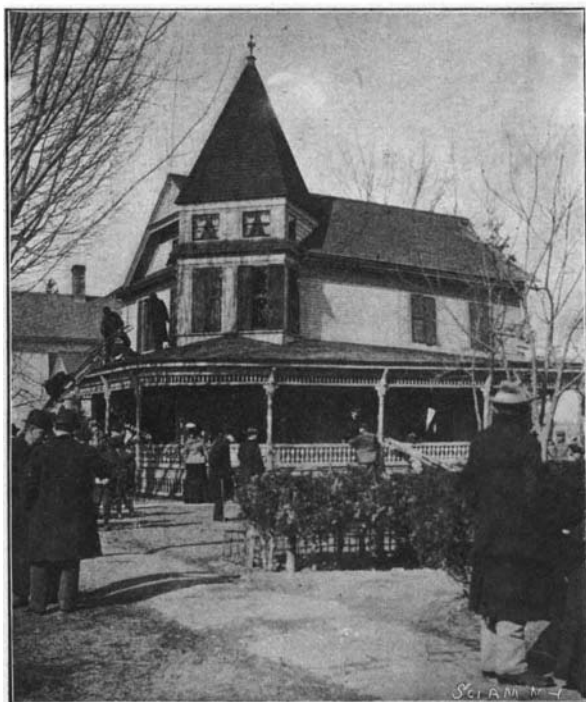
A RESIDENCE IN WEST BROOKFIELD, MASS., ALMOST DEMOLISHED BY A GAS EXPLOSION.