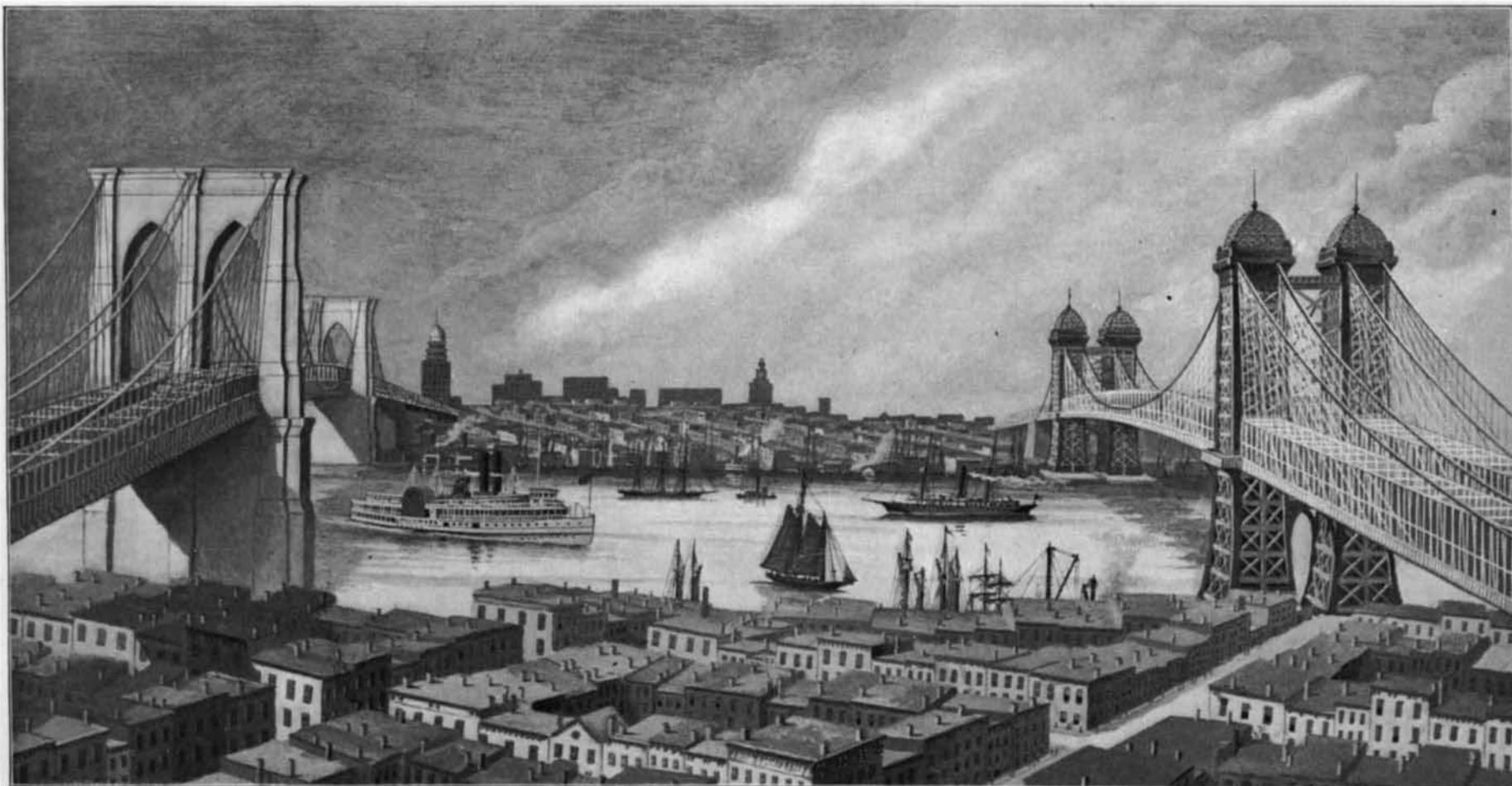
THE BROOKLYN BRIDGE AND SUSPENSION BRIDGE No. 3, ON WHICH WORK HAS JUST COMMENCED.