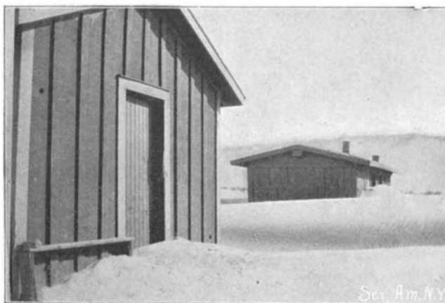
SAND DRIFTS AT RIMLON, CAL.

and south of Beaumont are the peaks of San Gorgonia and San Jacinto, averaging about 12,000 feet above sea level, and between these giant portals there blow at certain seasons of the year violent winds which pick up the sandy soil of the desert and use it as a sand blast to erode anything of a softer nature than itself.