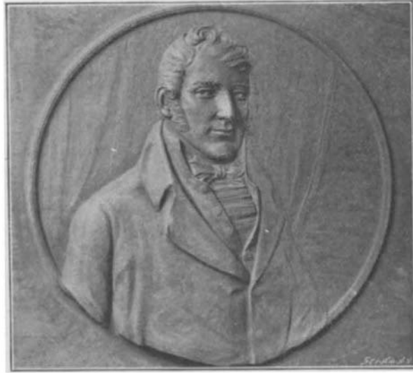
THE BRONZE MEDALLION OF ROBERT FULTON.

"Now, if the plaintiff perceived that this vehicle was in the road, he was bound to act as would a reasonable, prudent man with regard to his own horse, and that and the circumstance, if you believe it to be true,