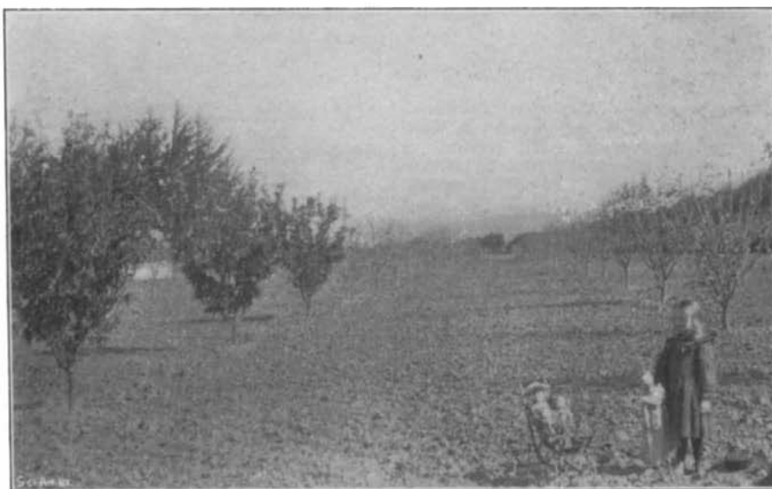
TWO ROWS OF FRUIT-TREES, THE ONE TREATED FOR SCALE, THE OTHER UNTREATED.

The beam with the shovel attached is operated in