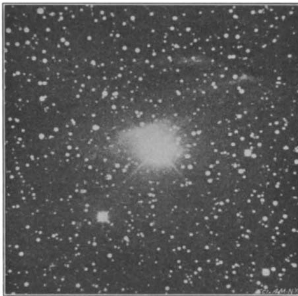
NEBULOSITY ABOUT NOVA PERSEI, NOV. 13, 1901.

The negative for September 20 was made with an ex-