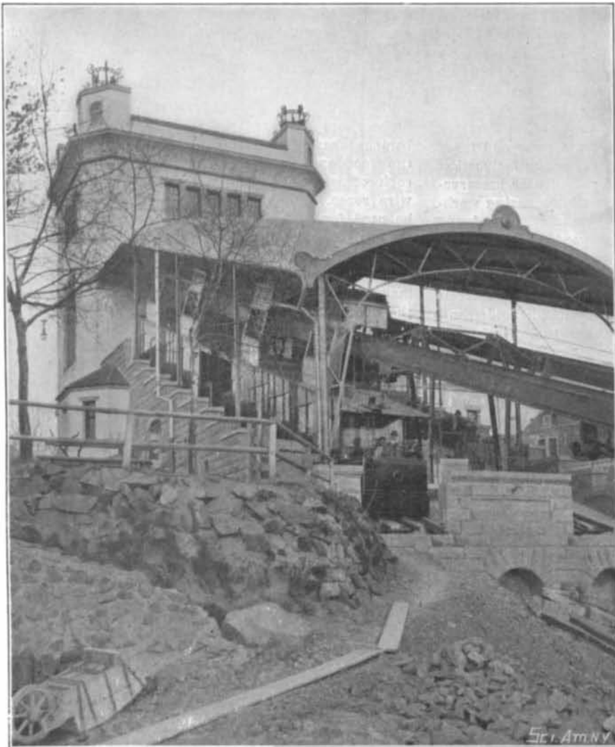
SUSPENSION RAILWAY AT LOSCHWITZ, SAXONY—A TERMINAL.