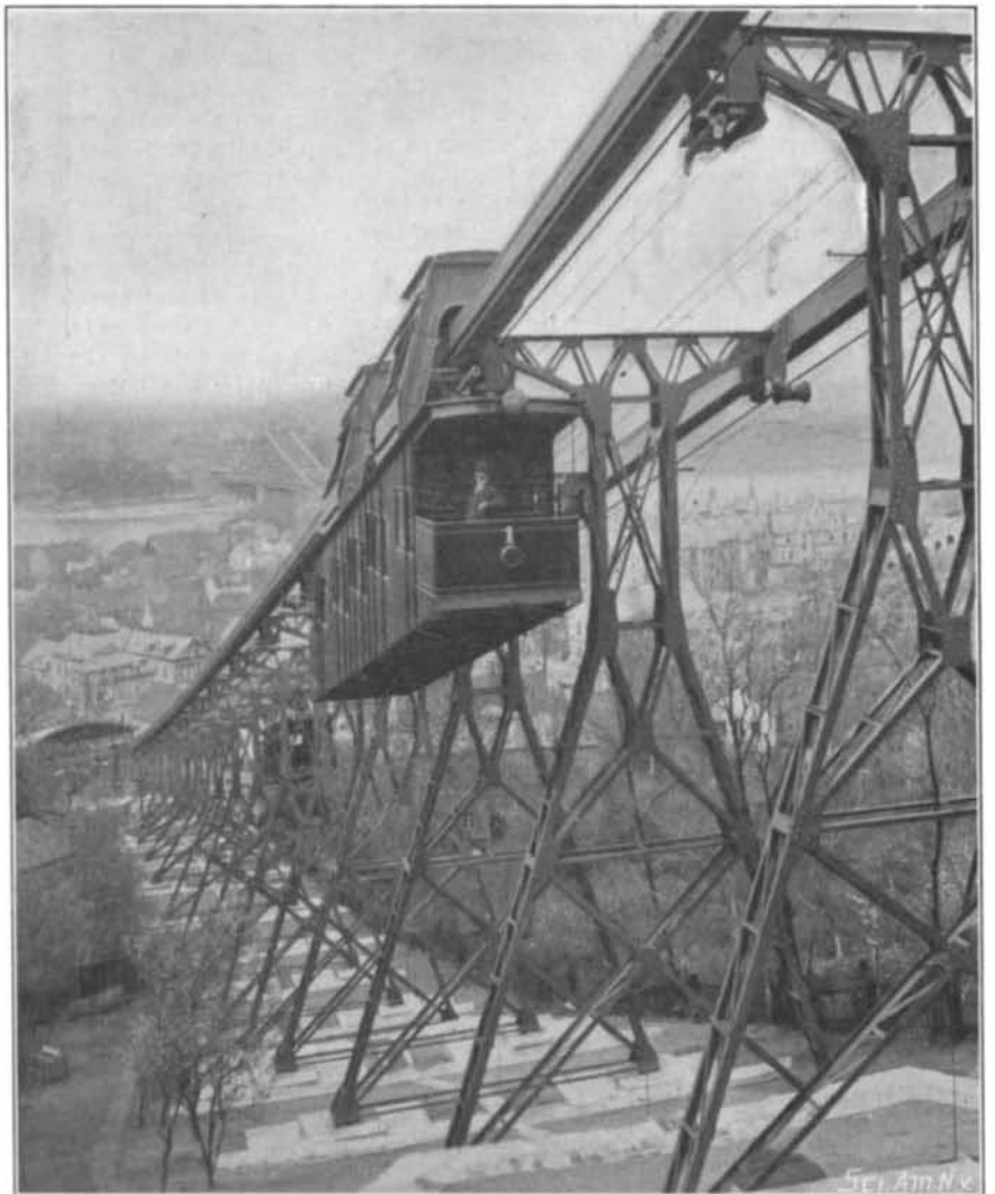
THE LOSCHWITZ SUSPENSION RAILWAY—A CAR EN ROUTE.