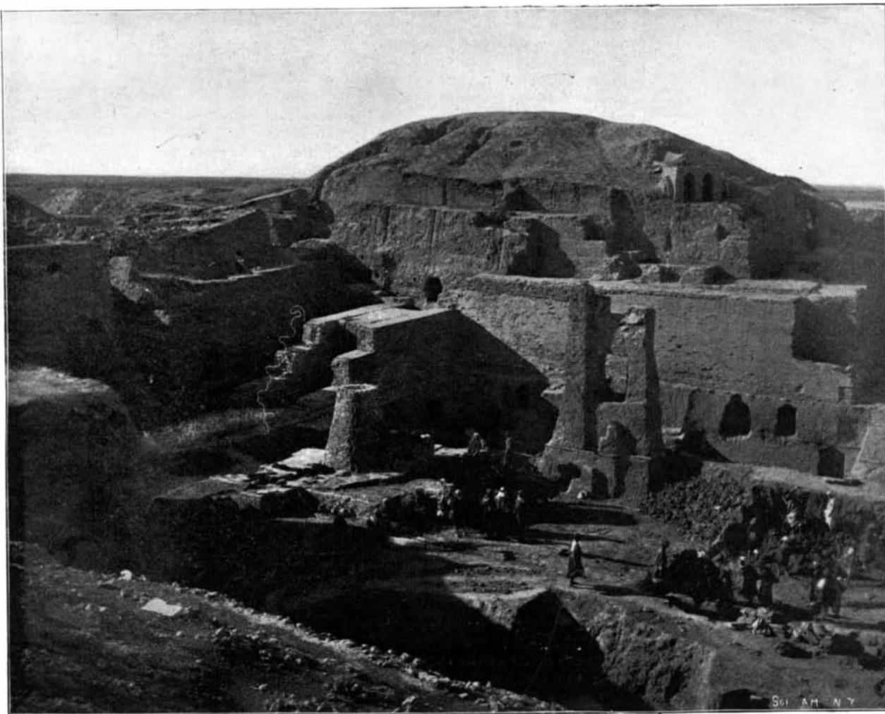
THE STAGE TOWER OF THE TEMPLE OF BEL—WORKMEN ON THE TEMPLE OF SARGON.

For eleven years, including interruptions, the "death-like stillness" which brooded over this ancient city (the probable site of Calneh, Genesis, 10: 10) with its treasures of long-forgotten millenniums has been dispelled, and the place has been the scene of much activity on the part of the American expedition. Though much has been accomplished in the laying bare of ancient buildings and the gathering of the exceedingly rich harvest of antiquities, yet at the present rate of operations, although on an average several hundred Arabs have been employed, it will require fully one hundred years to excavate thoroughly this ancient city.