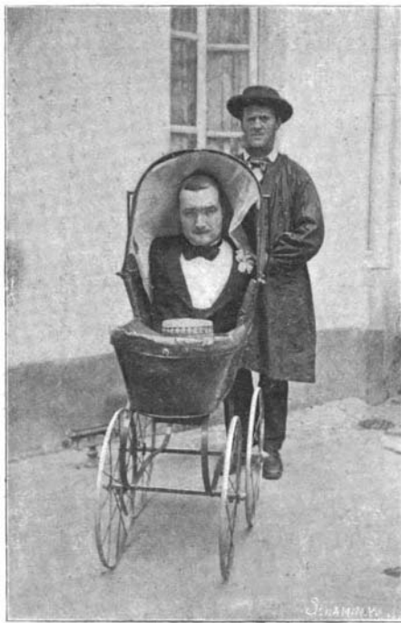
Taking an Airing.

on a diet of flies and beetles. Just before leaving them for the night several fresh flies were added and matters seemed all serene. Whether a quarrel came up in the night, or whether the fly diet proved unsatisfactory one may not say, but the next morning the green Mantis was monarch of all she surveyed, and in one corner of the cage were a pair of brown forelegs. She probably