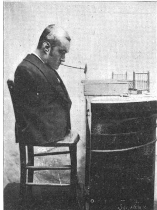
Making Toy Furniture.