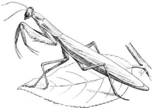
THE MANTIS RELIGIOSA—NATURAL SIZE.

This remarkable person, who was exhibited in Paris at the time of the Exposition, is one of the rare examples of a human being who has been from birth deprived of his arms and legs; he was born in France in the department of Morihan (Brittany), his father and mother being in easy circumstances and living upon a small farm. Both the parents are of good constitution and physically normal. Their son, now about twenty-five years of age, has no apparent trace