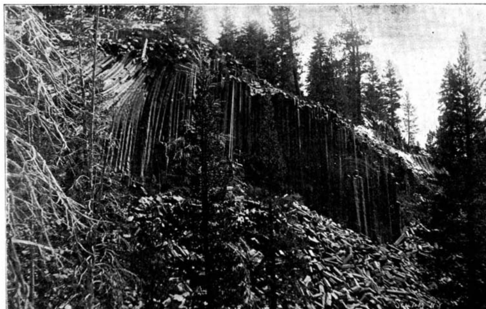
BASALT COLUMNS—YOSEMITE NATIONAL PARK.