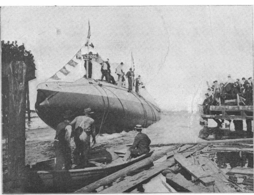
LAUNCH OF THE SUBMARINE BOAT "FULTON."

insufficient for permitting the observation of the nadir during the day. Third, floating baths; a floating bath with a thin layer of mercury, proposed by P. Gautier, was tried with success at Paris and Melbourne, but it was afterward shown by Perigaud that its advantages had been wrongly attributed to the floating, and his experiments show that it is the thickness of the mercury which comes into play. The images are sharper as the layer is thinner. It is on this principle that are established the baths which are at present in use at the Paris Observatory for meridian observations. Fourth, suspended baths: this type of bath appears to have been proposed by Seguin and Mauvais in 1852. After placing the bath upon rubber plates or cushions they found that the best results were obtained by suspending it from rubber bands, and concluded that elasticity by traction is preferable. At Melbourne, Mr. Ellery, in 1888, found that the rubber band sys tem overcame the large trepida-