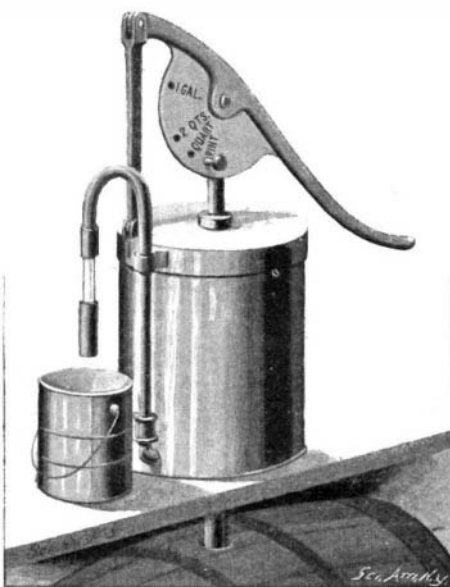
A SELF-MEASURING PUMP FOR LIQUIDS.

Integral with the handle of the pump is a segment composed of two parallel parts straddling the piston-rod. The segment parts are provided with registering openings through which a pin may be passed, designed to come into contact with the piston-rod when the handle is raised and then limit the stroke of the piston. The bottom of the cylinder is perforated to receive a suction-pipe leading to the vessel containing the liquid. A valve in the suction-pipe is opened on the up stroke of the piston and closed on the down stroke. The liquid pumped in the cylinder is forced up into a goose-neck pipe connected with the cylinder and provided with a valve opened on the down stroke of the pump.