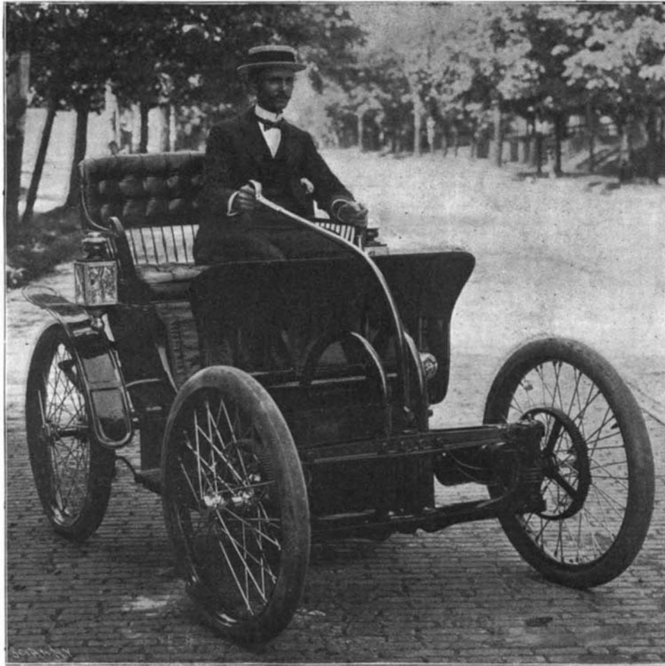
NEW FORM OF ELECTRIC AUTOMOBILE.

BREAKAGE of propeller shafts at sea costs an immense sum annually in salvage. Mr. Justice Barnes, of the British Admiralty Court, said recently that during the past two years the amount awarded by that court for salvage of steamers thus crippled was £135,406, while the total awarded in other cases of salvage amounted to only £95,630.