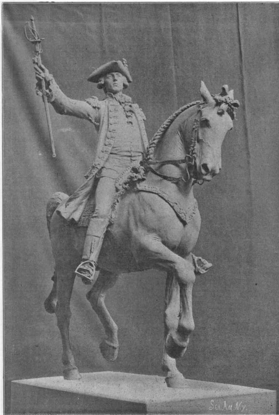
STATUE OF LAFAYETTE UNVEILED AT PARIS ON JULY 4.

A use has been discovered for old spiral car springs, says The American Railroad Journal. It has been found that these often contain enough carbon to permit of making cold chisels. Forging into the necessary form is easy and the additional carbon required may be added by the cementation process. Cold chisels made in this way cost half as much as the high grades of steel which were formerly used.