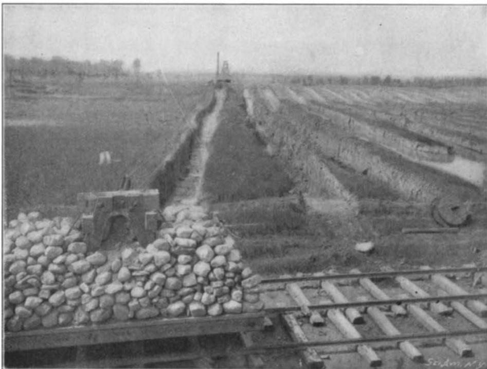
POWER SCRAPER AT WORK ON THE MESSINA CANAL.

Where the nature of the ground permitted it, extensive use was made, in the excavation of the St. Lawrence Power Company's canal, of the powerful steam-driven Vivian scraper. The character of the work done by these scrapers is very clearly shown in the accompanying illustration. The plant is composed of a tower and an anchor, which were placed on opposite sides of the canal. The anchor, which in the illustration is in the immediate foreground, carries a sheave, through which passes an endless cable. The tower carries the engine and boiler, and is placed far enough back from the cutting to allow of the formation of a spoil bank for the excavated material. Both the tower and the tail anchor are placed on trucks, which run upon parallel tracks on either side of the canal excavation, this arrangement being adapted to facilitate