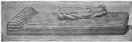
Style 6L. Camp Mattress with Pillow attached. Also showing Mattress deflated.

Clean and Odorless, will not absorb moisture. Can be packed in small space when not in use.