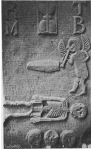
REMARKABLE GRAVESTONE AT FORRES, SCOTLAND.

Our illustration shows the methods adopted for utilizing the 12,000 horse power which was developed in the recent official trials of the "Viper." Four shafts are used, with two propellers on each shaft, the after