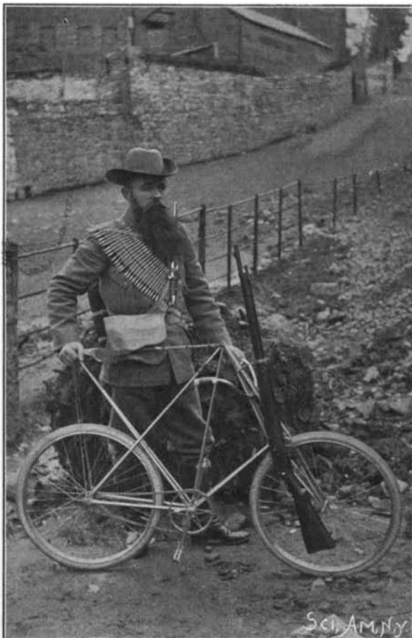
FOLDING BICYCLE, WITH RIFLE ATTACHED. WEIGHT, 15 POUNDS.

DURING some excavations in the Forum at Rome, the laborers unearthed the head and part of the body of a marble horse. It is a magnificent piece of sculpture, and great value has been placed upon it. According to experts, the relic dates from about the second century before Christ.