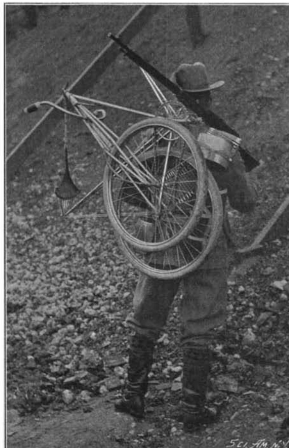
BICYCLE FOLDED AND CARRIED UPON RIDER'S BACK.