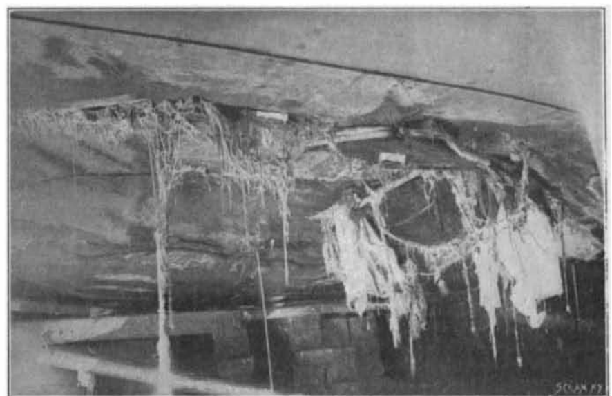
View from Port, Showing Temporary Patches Put on by Diver over Injuries between Frames 19 and 24.