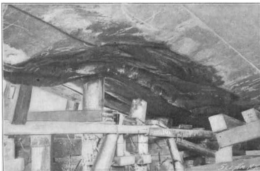
View from Port and Underneath, Showing Injury to Keel between Frames 14 and 19. Kure, July 25, 1900.

Local experts gave testimony in both peach growing and bee keeping. The justice gave judgment to the plaintiff to the amount of $25 and costs. If the case is sustained, it will render the owners of the bees liable in damages for their incursion on the premises of other property holders, the same as horses, pigs, and other