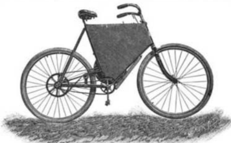
THE STEFFEY MOTOR CYCLE.

THE southern hemisphere has been visited by intense heat. A few days ago the thermometer registered 120°