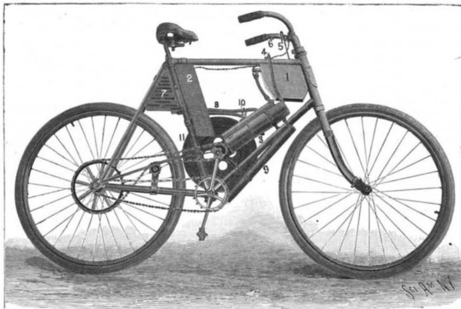
MOTOR ATTACHMENT FOR BICYCLES.

F. in the shade, nearly all day at Buenos Ayres, says The Medical Record. There were 102 cases of sunstroke, of which 93 were fatal, and the next day there were 219 cases, of which 134 were fatal. The weather has also been extremely hot at Melbourne, and in South Africa the British troops have suffered exceedingly from the almost unbearably high temperature. Indeed, the whole world seems to be warmer than usual, for the winter in this country has been far from severe, and in the Klondike the weather is almost