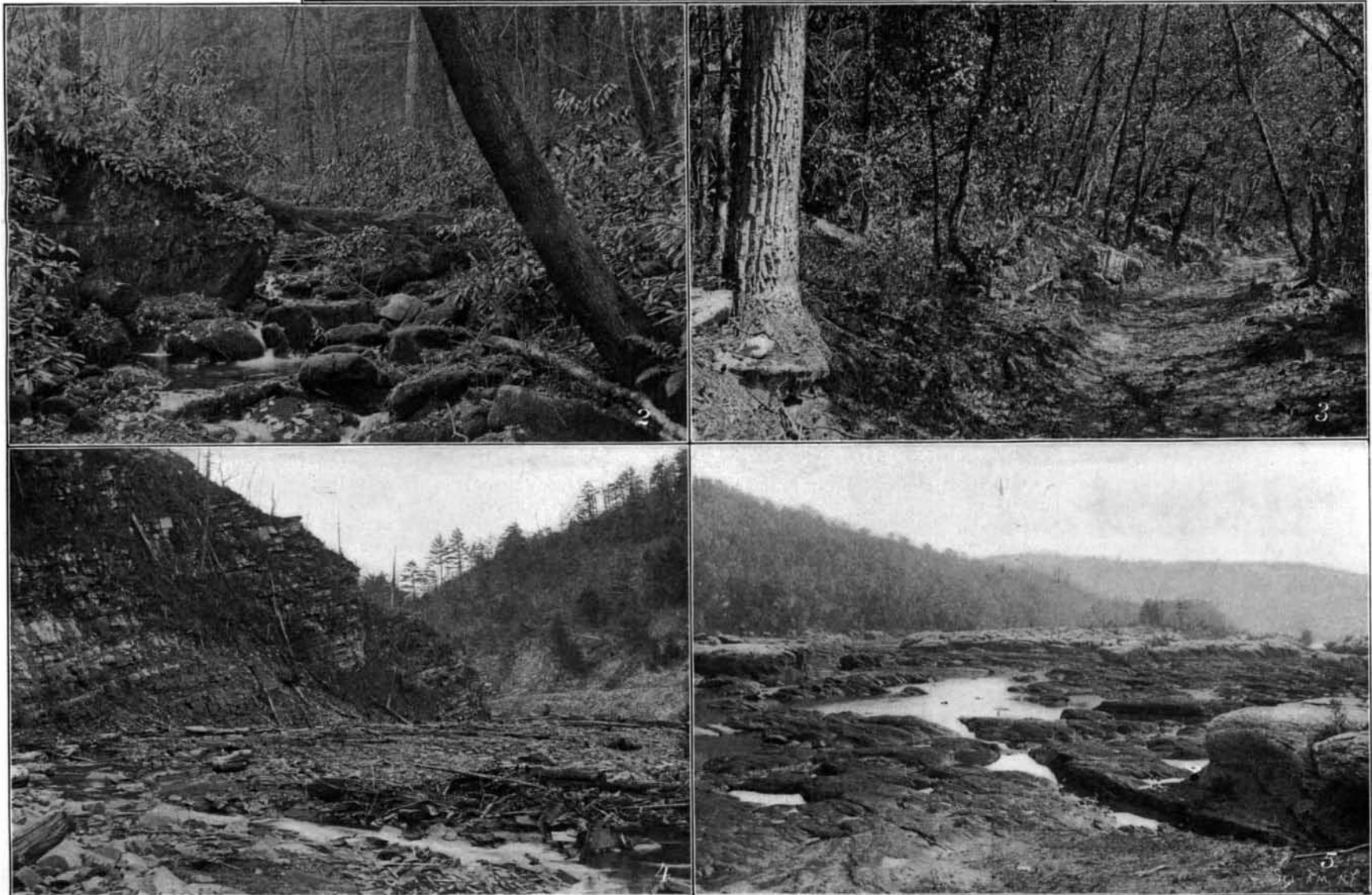
1. Arizona forest lands ravaged by fire. 2. Spencer River, Pa.—Such land should be reserved for forests. 3. Mifflin County, Pa.—Land more valuable to the State than to the individual. 4. Long Run, Pa.—Too rapid drainage producing extremes of high and low water. 5. Susquehanna River, Pa.—Dry stream bed, affording reduced evaporating surface.