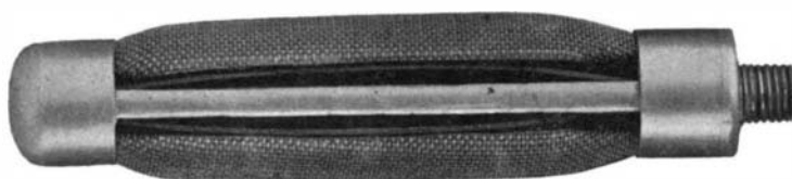
THE TOMLINSON GUN-CLEANER.

In the greater part of the carborundum goods put on the market the vitrified bond is used. The carborundum