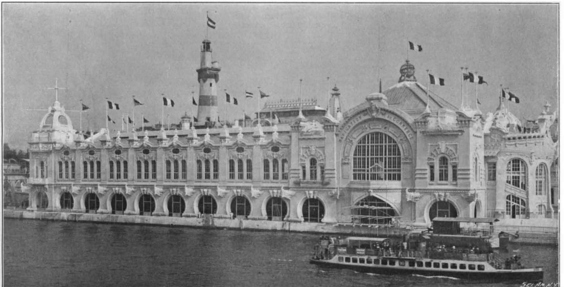
Commerce and Navigation Building on the Bank of the Seine.

SOME UNIQUE ATTRACTIONS OF THE PARIS EXPOSITION.—[See page 374.]