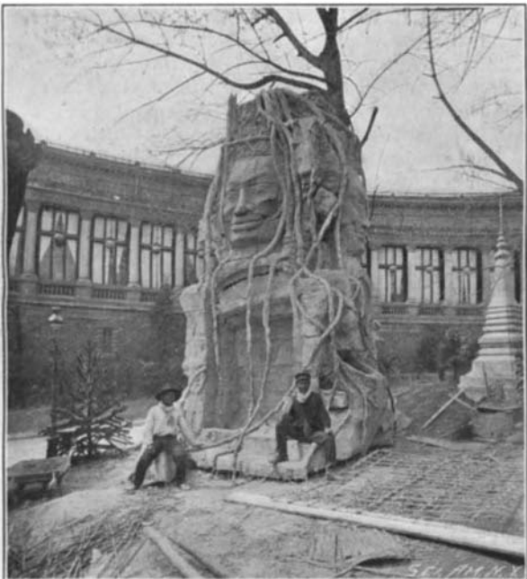
Indo-Chinese God with the Banyan Tree.