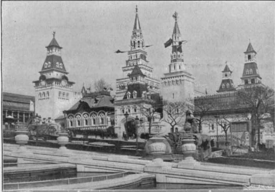
The Siberian Building.