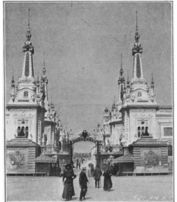
Buildings on the Esplanade des Invalides.