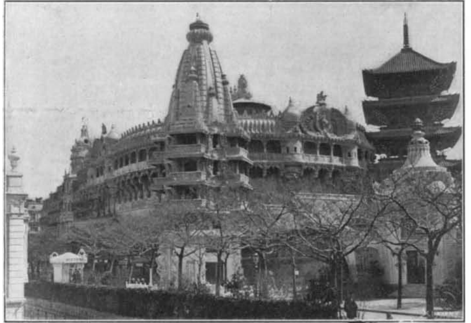
The Tour de Monde.