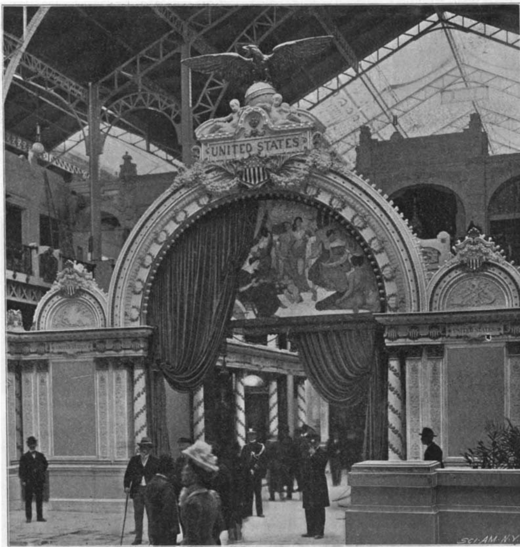
ONE OF THE ENTRANCES TO THE UNITED STATES EXHIBIT.

The disposition of these people to conceal suspicious cases of sickness constitutes the most serious difficulty to be overcome.