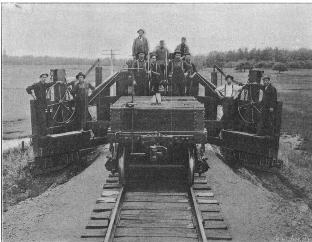
SHOULDERING CAR FOR TRIMMING ROADBED.

The dunes of Gascony are most remarkable. They rise, in one case, as high as 290 feet and very frequently rise to 130 feet over a belt of several miles wide and 150 miles long. Near the sea the ridges lie north and south, parallel with the shore. Further inland they trend east and west, parallel to the prevailing winds. Fields and forests were buried and the villages were overwhelmed by the advancing sand; mouths of streams were blocked and lagoons were pushed inland, invading and drowning fields and villages. Now, says Science, after many years of "experimental effort and nearly a century of systematic work, the advancing dunes have been arrested. A half artificial dune or dike runs along the beach with a very gentle slope to the sea. Here the wear of the winter storms must be repaired during the succeeding summer. Next follows a protection zone, 1,000 to 5,000 feet wide, covered with stunted firs and bushes where the first strength of the sea wind is expected. Then comes the great artificial forest of firs and oaks, under whose cover the invasion of the dune has entirely ceased.