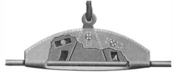
A SIMPLE FORM OF WIRE-HANGER.

It may sometimes be necessary electrically to connect the adjacent ends of two wires with a hanger. The clamping-blocks are, therefore, provided with openings to receive the upwardly-turned ends of the wires.