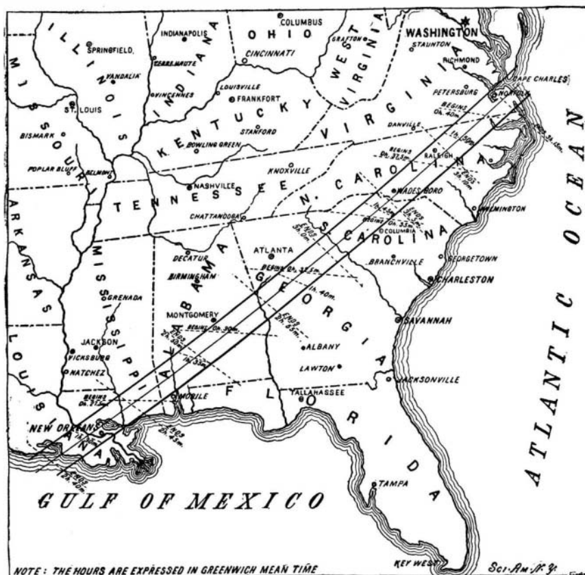
PATH OF THE TOTAL ECLIPSE OF THE SUN, MAY 28, 1900.

Georgia, South Carolina, and North Carolina, and will even touch Virginia. The track of totality begins on the Pacific Ocean just west of Mexico, enters the United States near New Orleans, and passes in a north-easterly direction until it reaches the sea at Norfolk and Cape Henry. Its path then crosses the Atlantic Ocean and touches Portugal, Algiers and North Africa, and will terminate near the northern end of the Red Sea. The eclipse will last 1 minute and 12 seconds near New Orleans, and 1 minute and 40 seconds near Norfolk. It is probable that large numbers of people will take the railroads to points where the eclipse can be seen. A number of experimental stations will be established by the government along the path of the eclipse. The necessary apparatus is now being gathered and arranged, and men specially adapted for the work are being engaged and are trained. Congress has allowed $5,000 to the Naval Observatory and $4,000