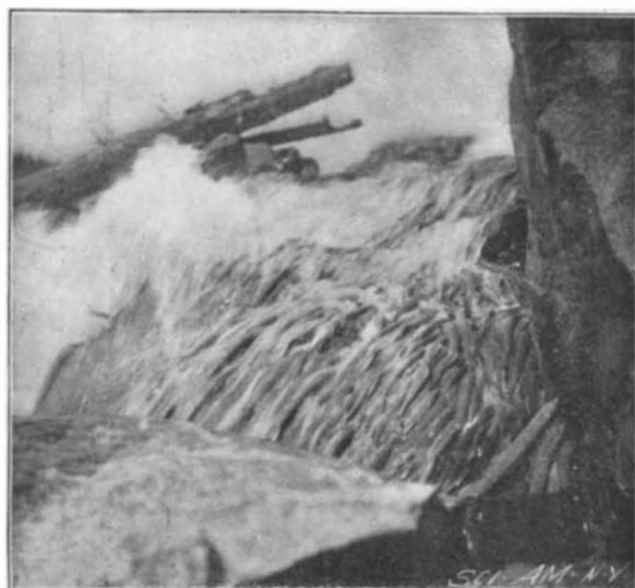
LAMPREYS ASCENDING WILLAMETTE FALLS, OREGON.

States and Europe. Most of the camera studies of fishes have necessarily been addressed to fish in aquaria, as the opportunity rarely presents itself for getting satisfactory views of fish in a wild state. How many really good photographs of fish in the native waters have been made?