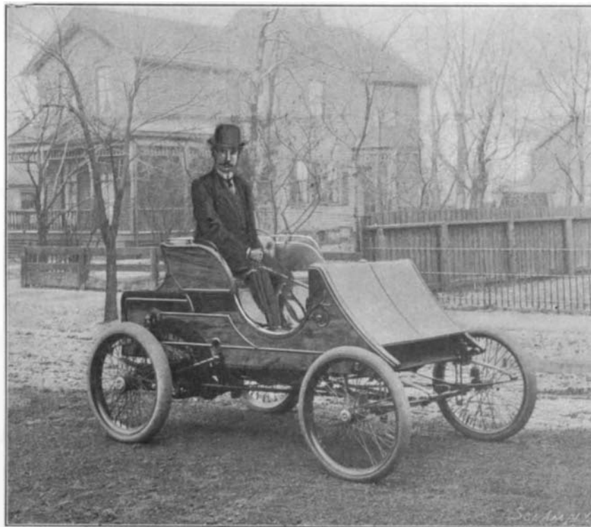
THE WINTON MOTOR CARRIAGE WHICH WILL COMPETE FOR THE GORDON BENNETT CUP IN THE INTERNATIONAL RACE IN FRANCE IN JUNE.

The conditions for the Gordon Bennett automobile cup race, offered by James Gordon Bennett, publisher of the New York, and Paris Herald, have now been formulated, and the race will take place on June 14, 1900. There is every indication that the event will be one of the most important which ever occurred in the automobile world. We take pleasure in presenting an engraving of the racing machine which Mr. Alexander Winton will use in the race. The motor contained in this carriage is about 10 horse power, and the complete machine weighs about 2,000 pounds. It is to be hoped that an American machine may win this important trophy, which is undoubtedly destined to occupy the same place among automobilists that the "America's" cup does among yachtsmen. Mr. Win-