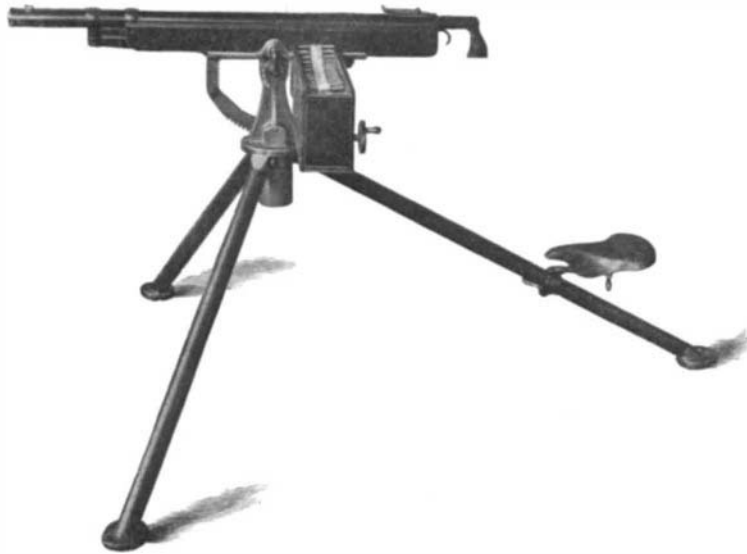
COLT AUTOMATIC GUN ON TRIPOD, WITH BOX OF BELT AMMUNITION ATTACHED.

Amazon tributary to the west, inasmuch as both flow from the same slope and in the same direction. A very small quantity of water from the Amazon does, however, enter the Tocantins through several narrow arms of the Amazon delta. This does not, however, make the two rivers belong to the same system.