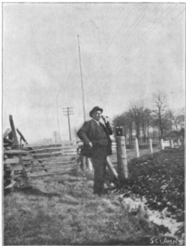
HOME-MADE FENCE TELEPHONE SYSTEM.