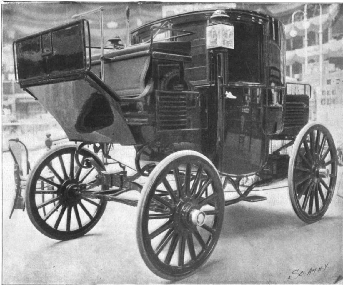
THE RIKER ELECTRIC BROUGHAM.

THE St. Clair and Erie Ship Canal project involves building a canal across the narrow neck of land separating Lake St. Clair and Lake Erie; the distance is only thirteen miles. The construction of this canal would save seventy-nine miles of dangerous lake and river navigation. The canal would be of great advantage to the United States shipping. The shipping passing through Detroit amounts to 32,000,000 tons per annum, and it is estimated that at least two-thirds of this amount would use the canal. The Canadian Engineer claims there would be a saving of $1,014,000 a year to the vessel-owners by reason of the shorter and safer route via the canal.