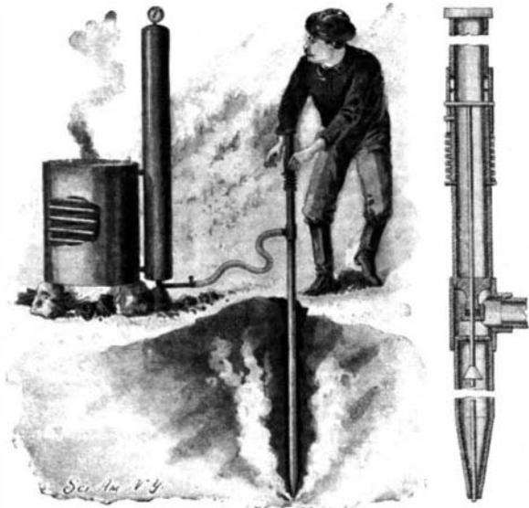
MINER'S DRILLING AND THAWING DEVICE.

Referring to the sectional view, it will be seen that the drill-point is hollow and is provided with a steam-pipe supplied from a boiler. The admission of steam is controlled by a valve, the stem of which runs down to the point and up through the handle-bar, where it is provided with a cross-pin engaging slots in a spring-