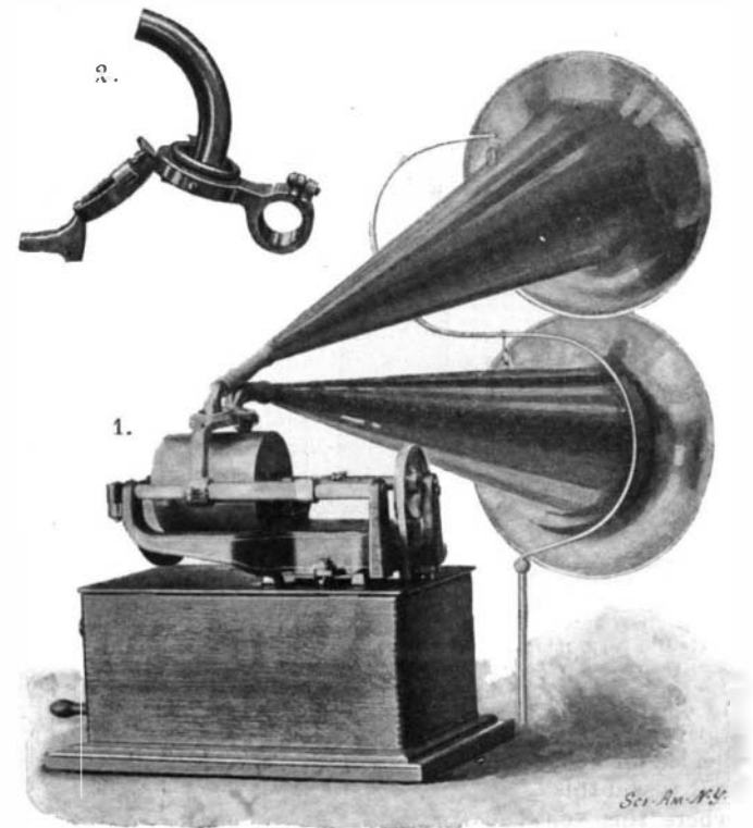
THE "POLYPHONE"—NOVEL ATTACHMENT FOR PHONOGRAPHS.

Money has been, and always can be, made more easily out of simple patented inventions than out of any investment or occupation. Great discoveries take