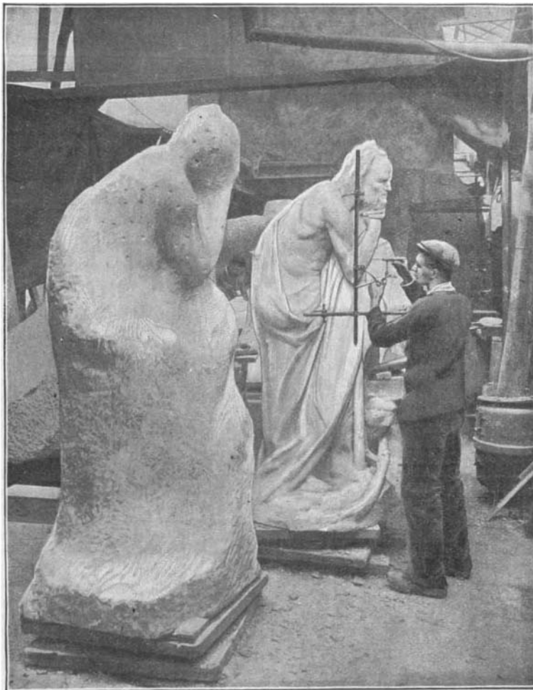
METHOD OF USING THE "SCULPTOR'S CROSS" IN REPRODUCING STATUARY.

end with a switch-operating plate. The foot-rod is normally held in raised position by means of a coiled spring. The switch-operating plate, as shown in Fig. 4, representing an inverted plan view, comprises two guides having obliquely-disposed edges converging toward the rear of the car. Two spring-pressed guide-fingers are pivoted in a depression at the rear ends of the guides. A pointed central guide is located in the rear of the oblique guides and is adapted for contact with pivoted fingers. When in contact with the pointed guide, the fingers and corresponding oblique guide form a straight line. The switch-tongue is provided with a projection (Figs. 1 and 3) normally spring-