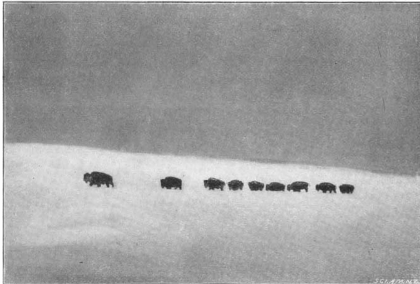
BUFFALO IN DEEP SNOW.

The December number of the BUILDING EDITION is fully up to the standard of its predecessors, and we are safe in saying that it is one of the most beautiful publications in the world. The houses are admirably selected and the engravings are reproduced with care