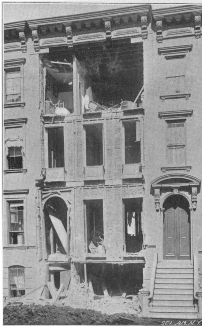
GAS EXPLOSION IN A RESIDENCE IN NEW YORK CITY.

THE Board of Health at Plainfield is considering the question of adopting a rule which will prohibit the burning of leaves within the city limits, as it is claimed that the practice is conducive to much ill health during the fall season. Several physicians have said that the smoke and smudge which comes from burning leaves is the cause of many of the ailments of the throat, lungs and eyes.