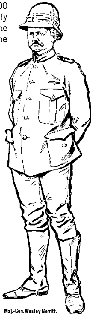
Maj.-Gen. Wesley Merritt.

S END us your address on a postal card, and we will mail you our Illustrated Announcement of the 1900 volume and sample copies of the paper Free.