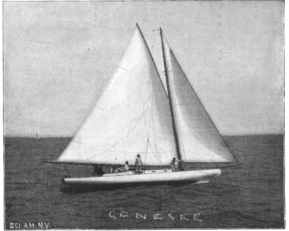
"GENESEE," WINNER OF THE "CANADA'S" CUP IN 1899.