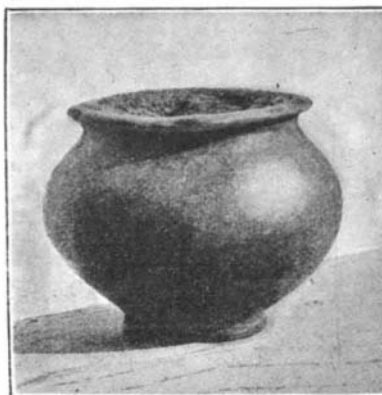
A Sacrificial Vessel.