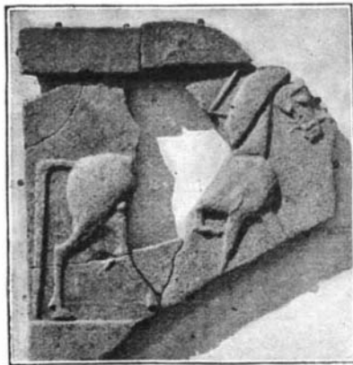
Fragment of a Bas-Relief.