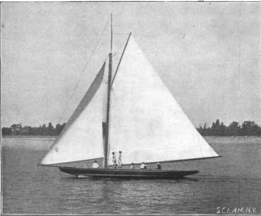
"BEAVER," DEFENDER OF THE "CANADA'S" CUP IN 1899.

modeled pretty closely upon the designs of ocean racers. This resemblance may be traced in almost all the yachts which have captured championship flags of any importance for some years past. The lines of the "Gloriana" were followed in the construction of the "Neva." The "Sultana," of Toledo, which won the Inter-Lake Association championship in 1894, is suggestive of the "Vigilant." The designer of the "City of