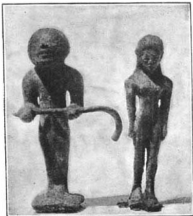
Statuettes of Phoenician Type.

The inscription, so far as it can be deciphered and conjecturally restored, seems to designate the spot as a peculiarly sacred sacrificial locality, and this is borne out by the objects found near the stele, small votive statuettes, vases, and objects in bronze, iron and marble. We reproduce, says The London Graphic, from photographs, some of these objects, the most ancient relics which have as yet been discovered in Rome.