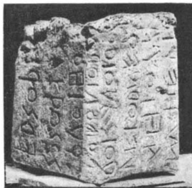
The Stele, Inscribed with Archaic Latin Characters.