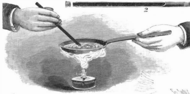
THE MAGICIAN'S OMELETTE.

It is hardly necessary to say that when the cooked omelette is carried down, the wand is left on the stand, which prevents any inquisitive person asking to see it.