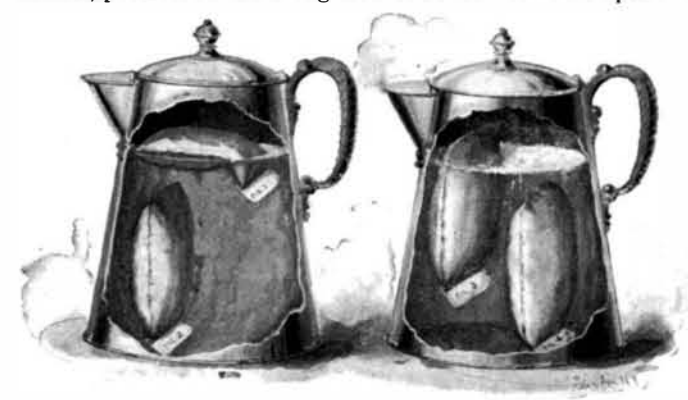
HUMPHREY'S PERCOLATOR PACKAGE FOR MAKING COFFEE,

be used every time that coffee is made, it is, nevertheless, possible to use a bag several times. This new lar. Upon the carriage two slides are mounted—a