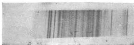
SPECTRUM OF ALUMINUM.